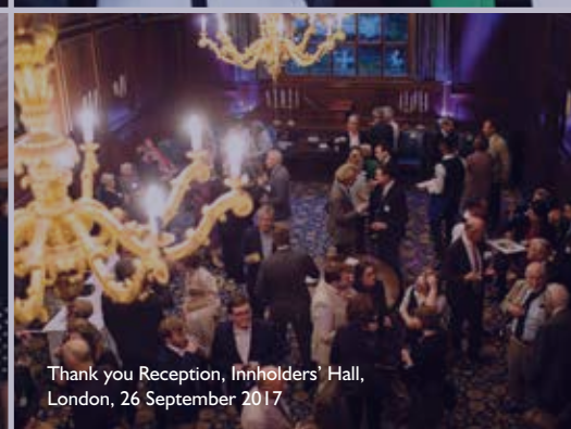
Thank you Reception, Innholders' Hall, London, 26 September 2017