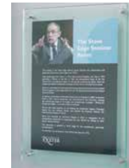
The Steve Edge Seminar Room recognition plaque