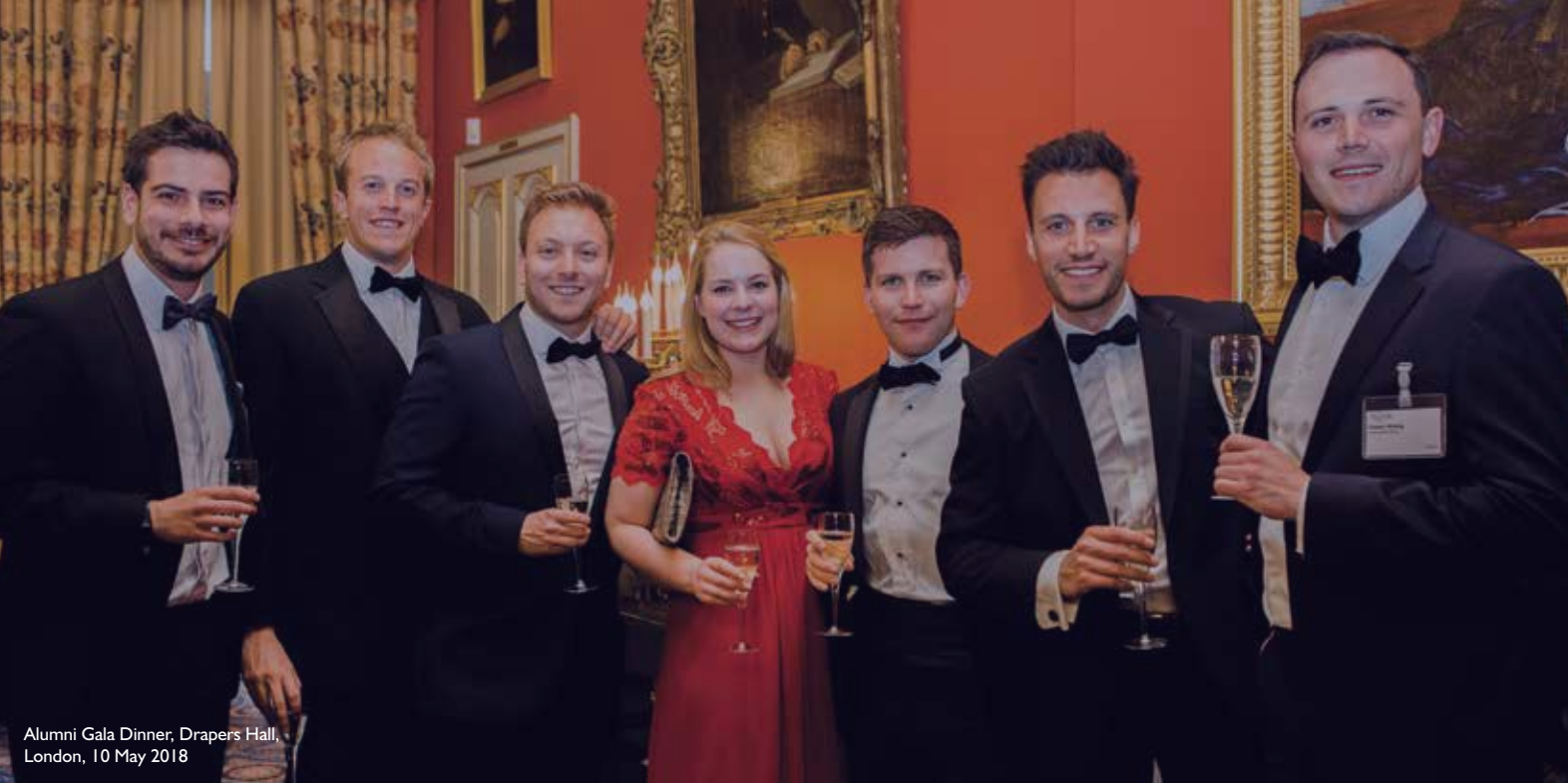
Alumni Gala Dinner, Drapers Hall, London, 10 May 2018