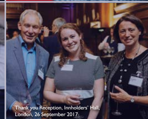
Thank you Reception, Innholders' Hall, London, 26 September 2017