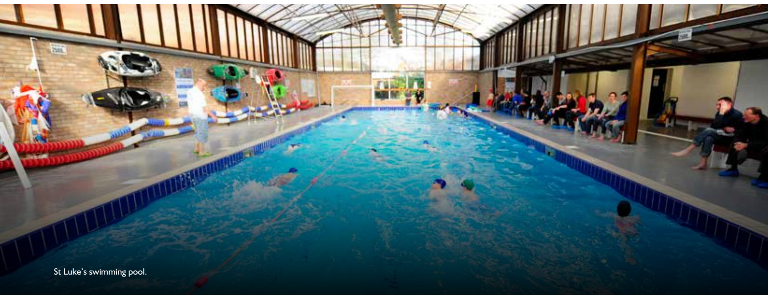
St Luke's swimming pool.

This will not only improve participation in sport for students with a disability, but will also support elderly and disabled members of the local community to take part in swimming.