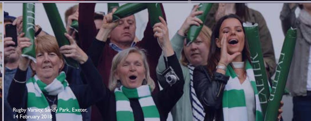
Rugby Varsity, Sandy Park, Exeter, 14 February 2018