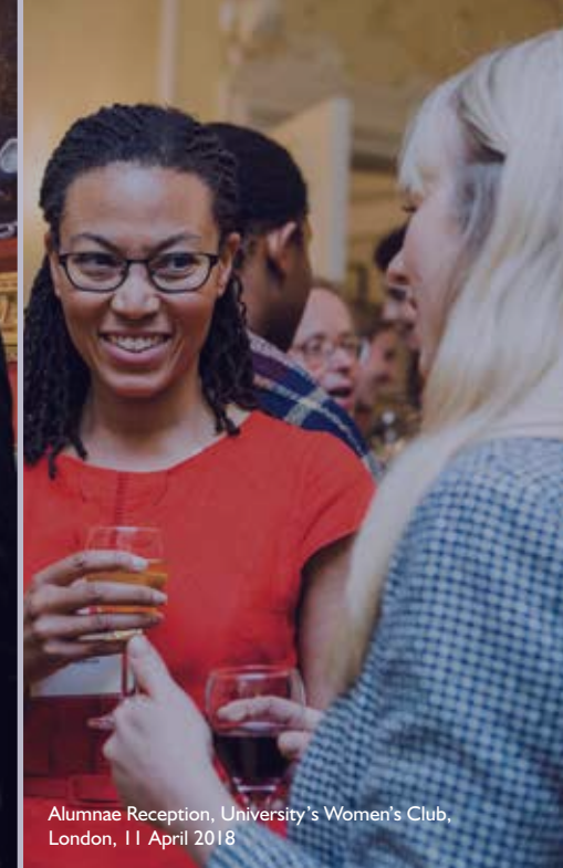
Alumnae Reception, University's Women's Club, London, 11 April 2018