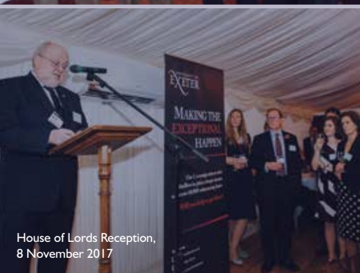
House of Lords Reception, 8 November 2017