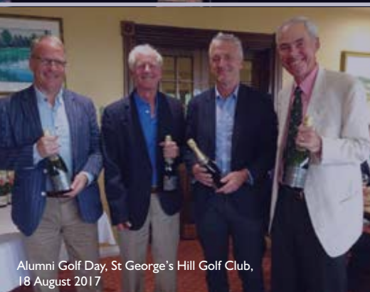
Alumni Golf Day, St George's Hill Golf Club, 18 August 2017